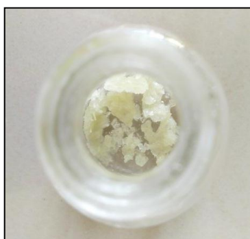
Figure 1. Isolated Andrographolide Crystal

In the identification of the structure of the compound used the infrared spectroscopy test or (FT-IR). Testing was carried out through FT-IR. Pure Andrographolide crystals were weighed and put into the tool. Install the DRS-8000A appliance. Sample test by including sample and KBr, the number of samples is about 5% -10% compared to the number of KBr. Operations are carried out with the aid of a computer. If the resulting spectrum is relatively short, it means that the number of samples