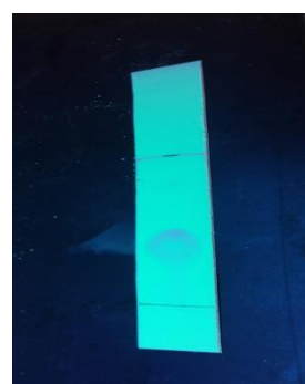
Figure 2. Results of Observation of Andrographolide Isolate Samples at UV 254

The large milky white crystal of Andrographolide was successfully isolated. It yields 1.4146 grams (0.47 %) (Figure 1). In the observation under UV 254 presented in Figure 2. one spot is visible purple.